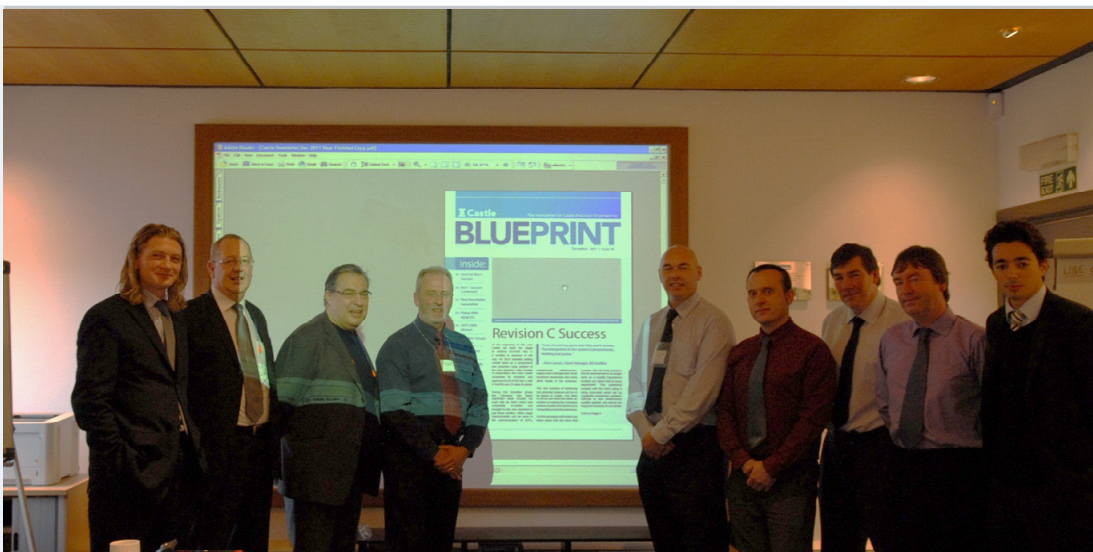
Castle Management Team beside BSI auditors in centre...The final piece of the puzzle.