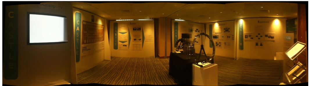
Castle's Presentation Room Above in Leicester Laid Out In The CASTLE Acronym.

This year marked the second year of involvement in the Rolls-Royce's Supplier Groups Programme and it would seem this year we hit the ground running. For those who have joined the Company recently and have yet to be introduced; SG is Rolls-Royce's supplier development programme. The initiative splits the Global Supply Chain into three segments; Europe, North America and Asia, and invites the best suppliers in these regions (62 Total) to engage with RR and other companies in the supply chain to share and develop best practice.