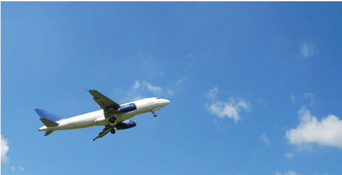
Blue Sky Thinking Applied To The Possibilities of a Customer/Supplier Relationship