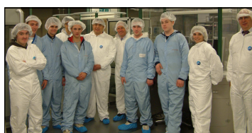
Pilsbury Dough Boys Make Finer Flour

We received the picture below as a token of thanks from British Energy for our engineering work on shafts during the R2 2006 outage