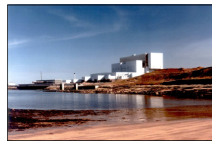
Oh I do like to be beside the sea side

We received the picture below as a token of thanks from British Energy for our engineering work on shafts during the R2 2006 outage