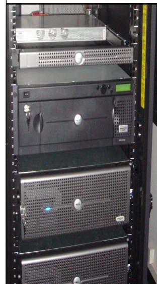
New Servers up and Running